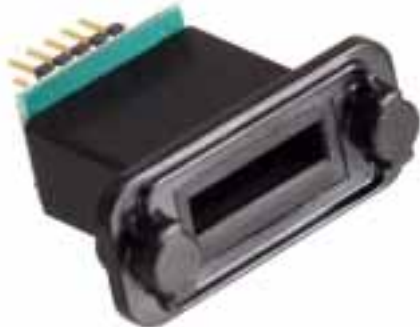
SR4310 Immersion-Rated Receptacle for Portable Data Carriers