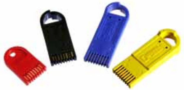
SlimLine™, Extended SlimLine™, & Managed-Memory® Tokens.

For more information, please contact the factory.