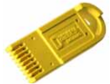
NFX Managed- Memory® Token

The SR4310 Receptacles are panel-mount devices that combine over-tighten protection and a gasket for sealing. They feature "molded-in" threaded inserts to provide easy and tamper-evident installation. These Receptacles include a detent mechanism that both increases Token retention and gives users tactile confirmation when an inserted Token is physically engaged, as well as a self "wiping" action that cleans the contacts with each Token insertion and removal.